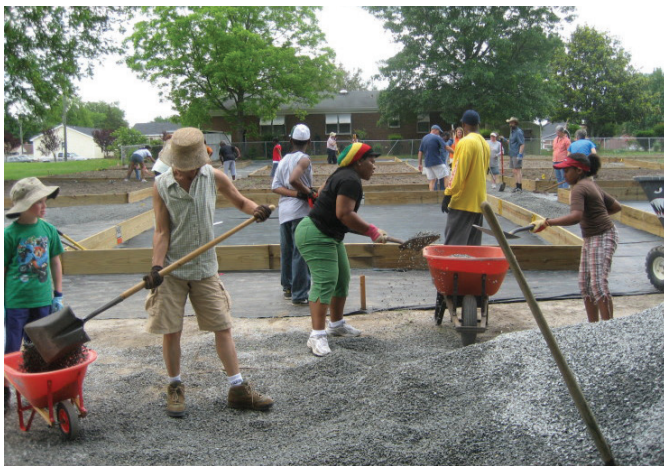
Sandhills Area Land Trust

The keys to a successful community garden of individual plots include forming a strong planning team, choosing a safe site accessible to the target audience with sunlight and water, organizing a simple transparent system for management, and designing and installing the garden. Even with all of these strategies, it is possible to have problems. Address them quickly and fairly before tensions build.