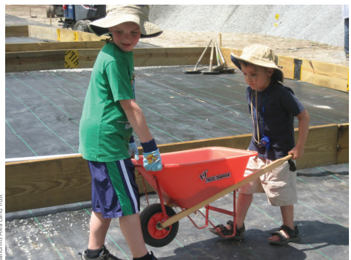
Sandhills Area Land Trust

Entrepreneurial Gardens: Gardeners, young and old, learn business principles and skills by growing and selling produce for local markets and restaurants. Many children have no idea where food comes from before it arrives in the supermarket. They have never seen a garden and have no